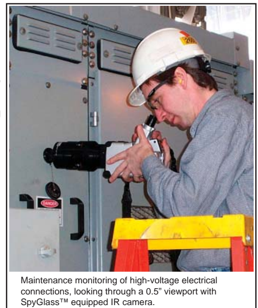
Maintenance monitoring of high-voltage electrical connections, looking through a 0.5" viewport with SpyGlass™ equipped IR camera.

This combination of window-free port and fisheye lens makes company-wide standardization feasible and affordable, because the <$50 cost of the ports comes down as quantity goes up. Industry leaders such as GE, Exxon Mobil, Boeing, Dupont and Cargill already have thousands of these ports installed. The patented viewports